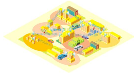
Figure 2 – ISP Backhaul

Smart Packet allows ISPs, who own no land lines, to quickly establish a backhaul without quality compromises. ISPs can grow up their profits by delivering services with guaranteed SLA or reaching distant clients from their PoP using radios with similar cost at licensed frequencies to avoid spectrum congestion.